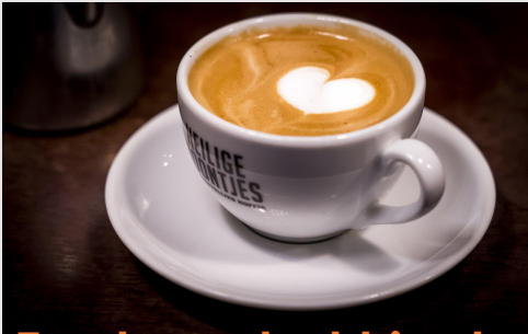
Eerst een bakkie doen