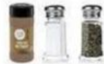
complete spice rack