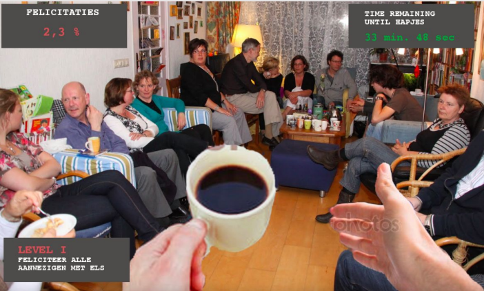
Dutch Birthday Party