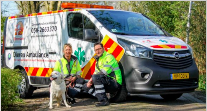
Animal Ambulance volunteers