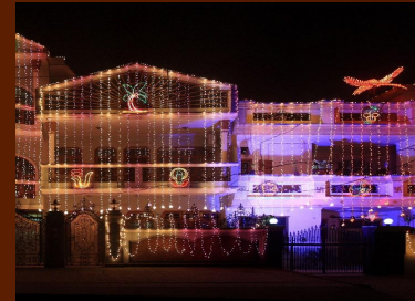
Lighting of Homes